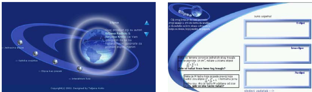
Figure 1. Multimedia ellipse: home page and interactive quiz page

As regards the above listed multimedia project requirements (3)-(6), (3) and (4) were much easier than (5) that was much easier than (6). Requirements (3) and (4) – dealing with the underlying structure and applications of the chosen topic – were more or less implemented in 11 developed artifacts. Some kinds of different learning paths were implemented in 8 artifacts (intuitive and theoretical approaches, two solutions of a task, two ways of introducing a concept). Only 2 artifacts tried to respect the P/C requirement (determining a position using the concept of hyperbola, procedural/conceptual quiz questions). However, having in mind the subjects' experience and relevant prior knowledge as well as the subtlety of the procedural-conceptual issues (cf. Haapasalo & Kadjevich 2000, 2003), the project can be considered successful (see Kadjevich 2002). Four screenshots concerning one of the best developed artifacts are presented in Figures 1 and 2.